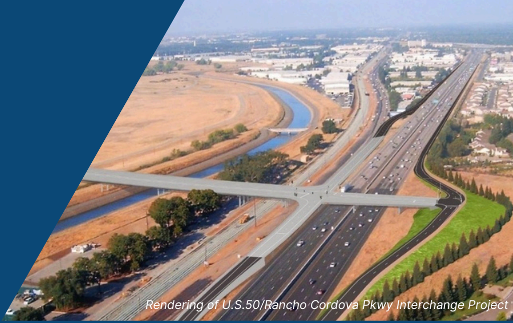
Rendering of U.S.50/Rancho Cordova Pkwy Interchange Project