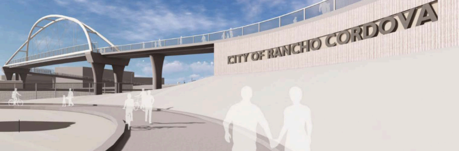
Rendering of Zinfandel Bike-Pedestrian Bridge