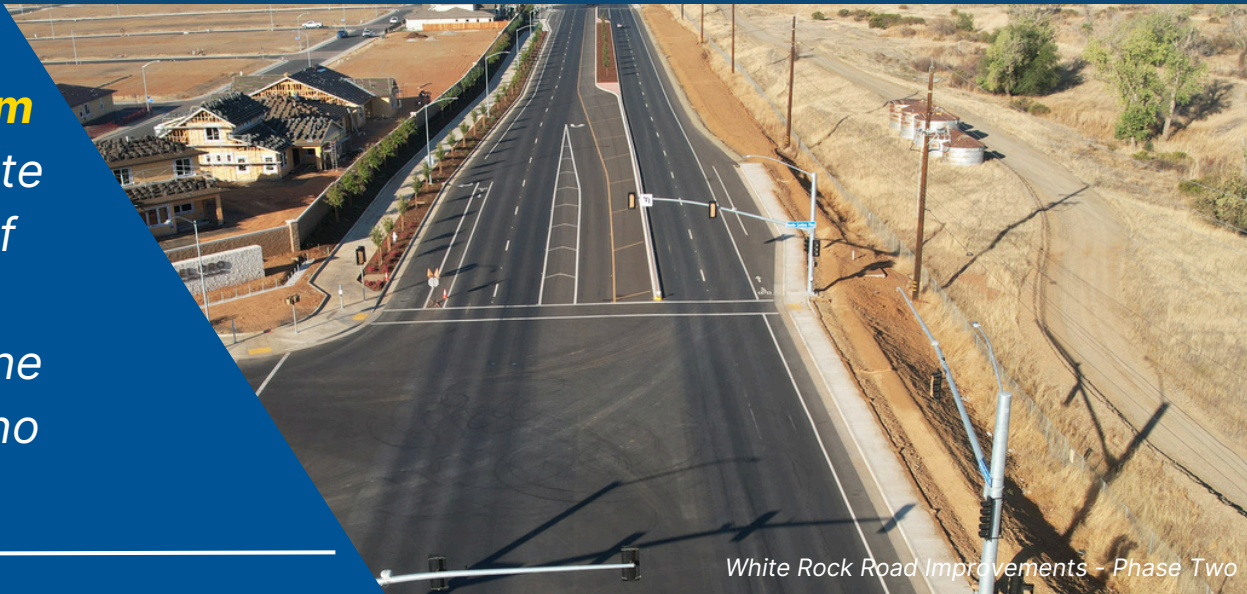
White Rock Road Improvements - Phase Two

Join our team as we innovate the future of movement throughout the City of Rancho Cordova