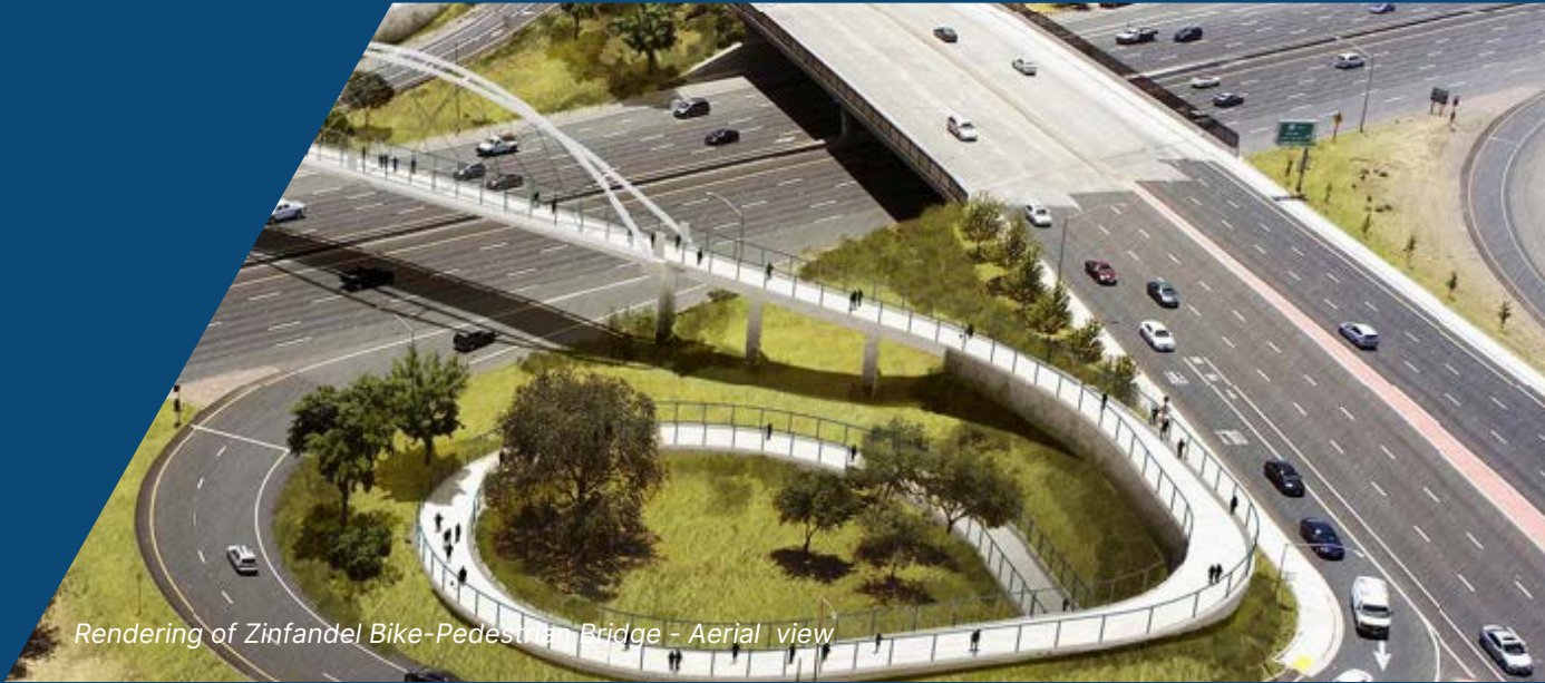
Rendering of Zinfandel Bike-Pedestrian Bridge - Aerial view